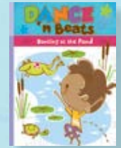
EXPLORE THE POND