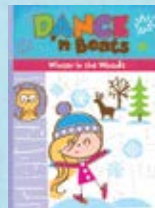
WINTER IN THE WOODS