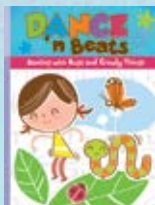
BUGS AND CRAWLY THINGS