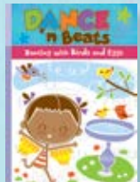
BIRDS AND EGGS