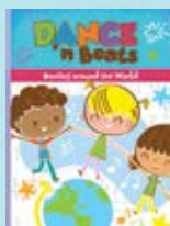
AROUND THE WORLD