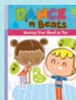
FROM HEAD TO TOE