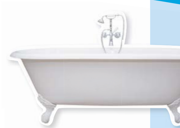
Photo or picture routines help the child anticipate and participate in daily routines. This repetitive schedule helps calm your child and supports cognitive skills.