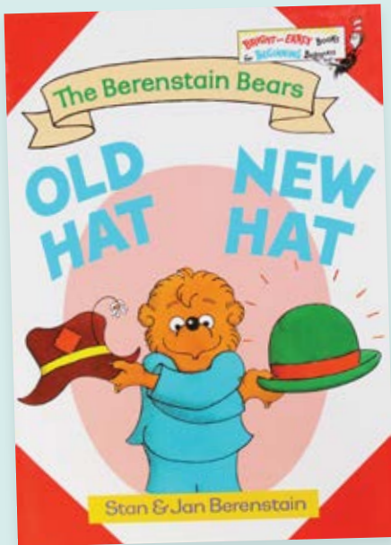
Old Hat New Hat by Stan and Jan Berenstain

This week , let's read books about hats and clothing. Find this one at your library or on YouTube: