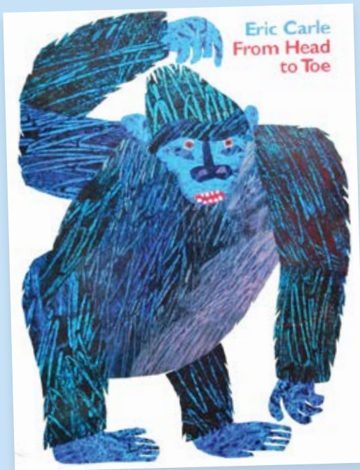
From Head to Toe by Eric Carle

This week , let's read books about our bodies. Find this one at your library or on YouTube: